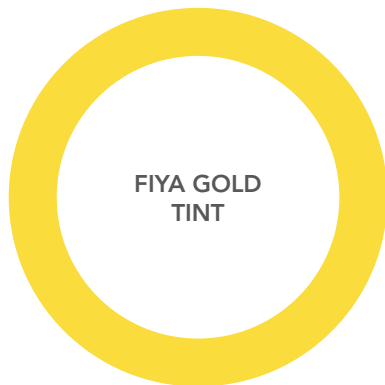
FIYA GOLD TINT

Pantone 114 C2 M10 Y86 K0 R253 G220 B63 HEX FDDC3F