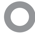
TEXT GRAY TINT

Pantone 165 C0 M75 Y95 K0 R231 G97 B39 HEX E76127